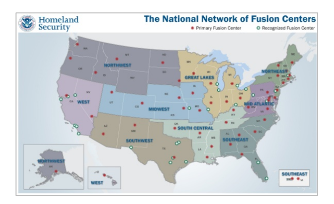
Figure 2: Intelligence and Information Sharing As of February 2012, the National Network of Fusion Centers includes 77 locations.